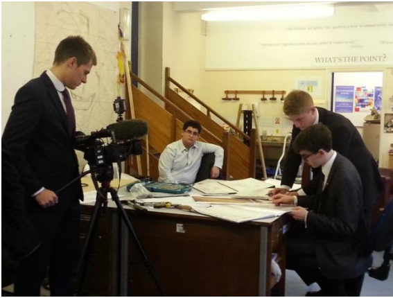
BBC East Midlands interview Ratcliffe students working on the Spitfire Project