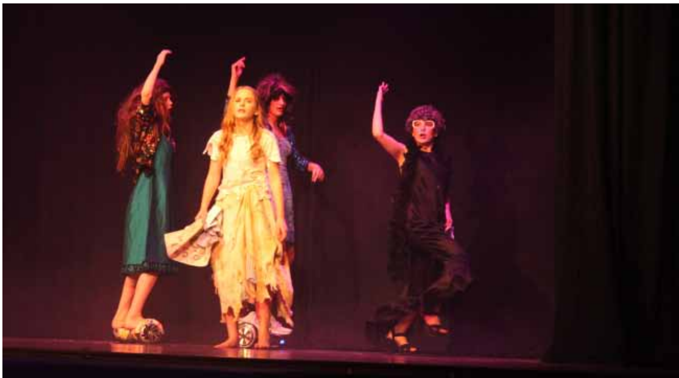
YEAR 8 STUDENTS PERFORMING 'CINDERELLA'.